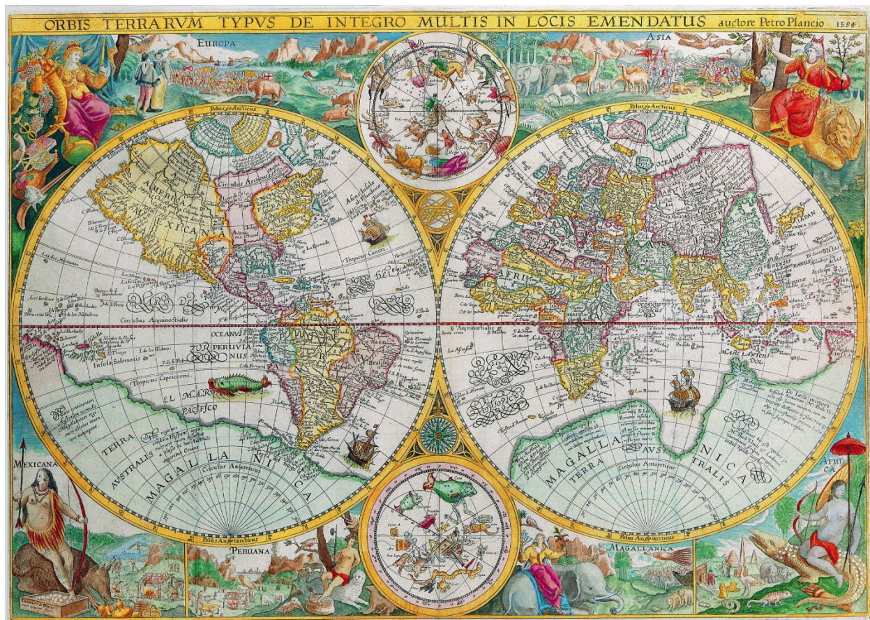
[Petro Plancio's World Map]